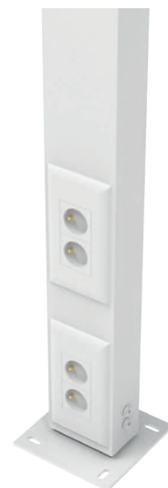
Power outlets can be placed in the construction elements.