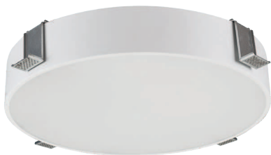
PLAFO 300 RE LED trimless version. Index no. 6572

System power consumption (LED module & driver) depends on components used