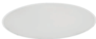
PLAFO 300 RE LED trimless version - mounted in the ceiling